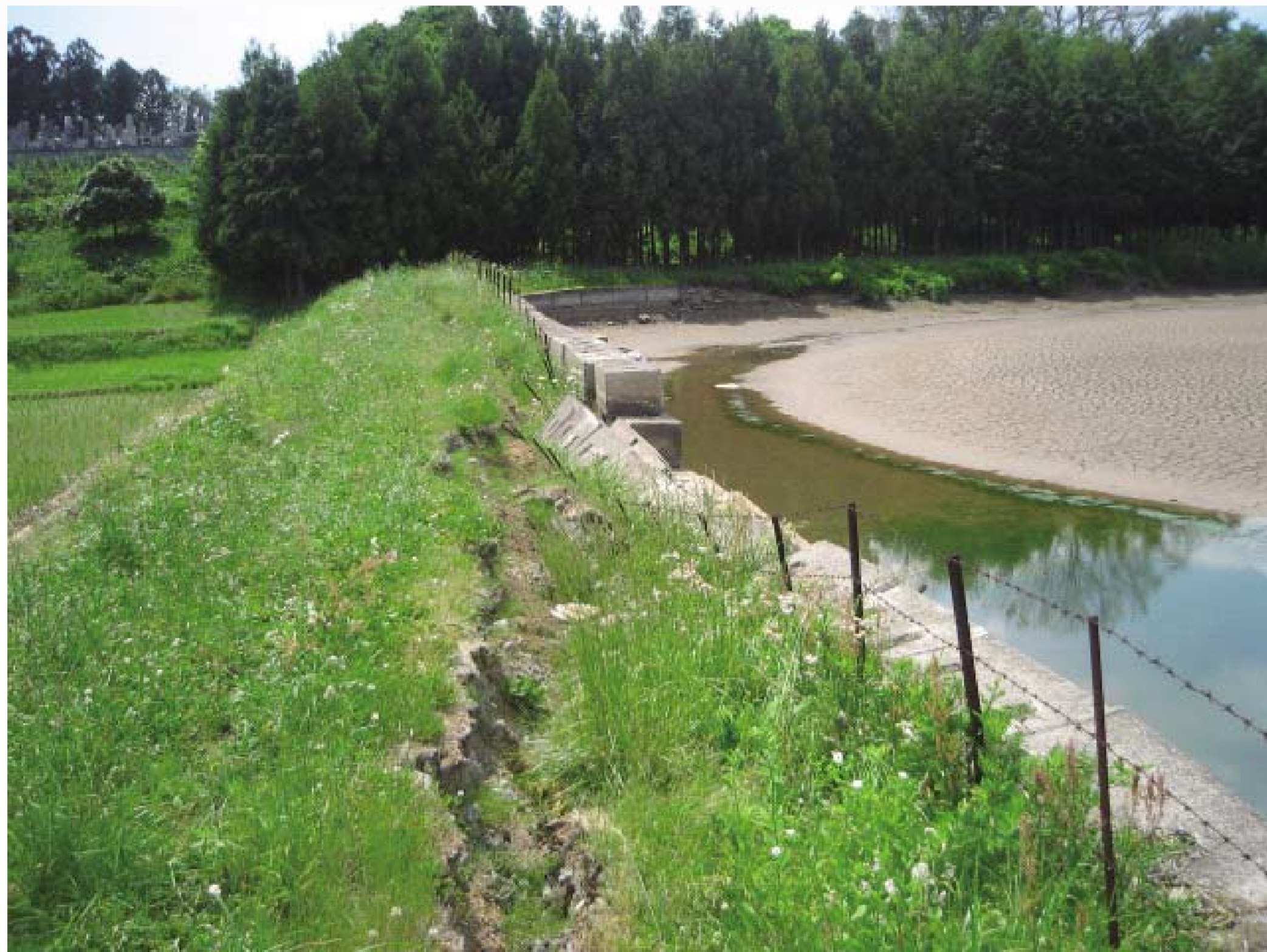
Earthquake Damage to Reservoir (Domae Pond, Fukushima Pref.)

In recent years, natural disasters like heavy rain and earthquakes have increased in frequency and scale, leading to escalated damage to embankments and reservoirs. Against this background, there's a growing need for rational measures to address these complex disasters.