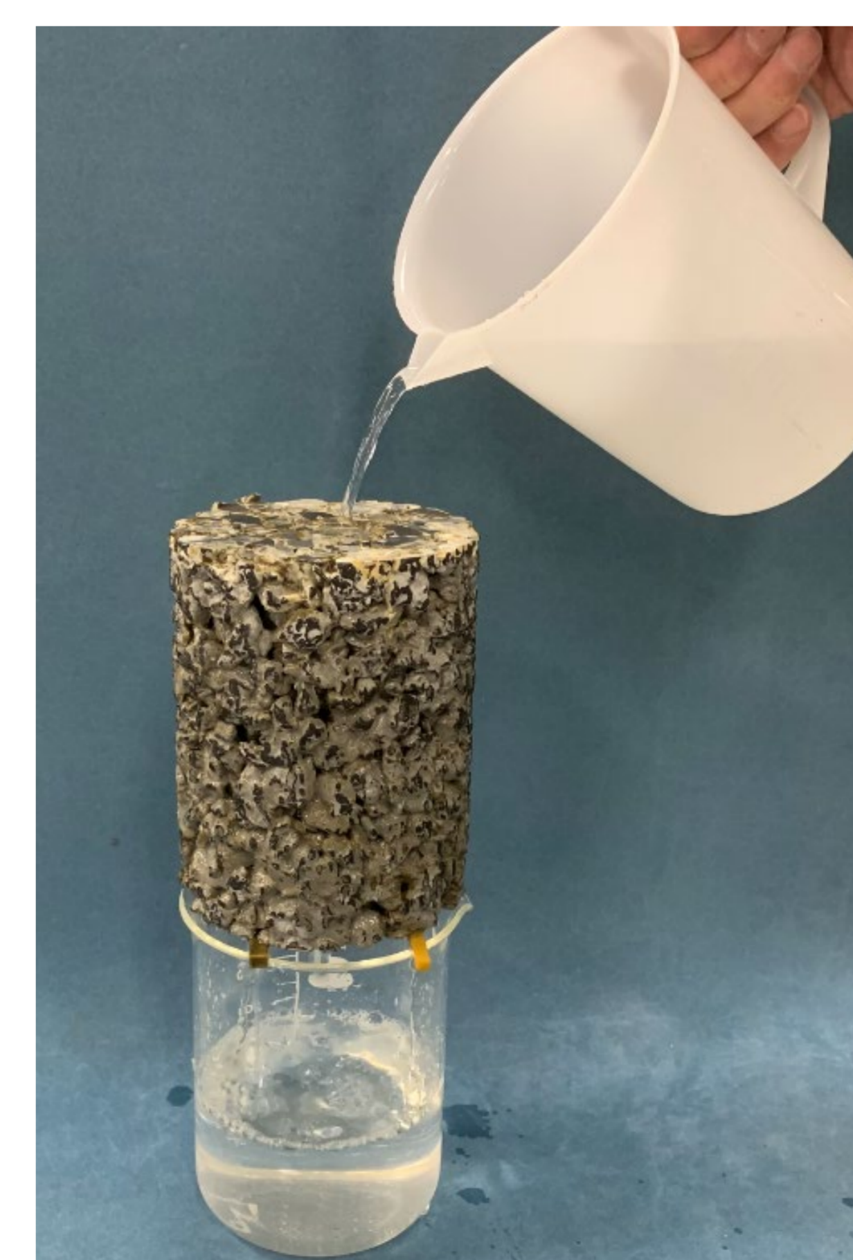
Permeable improvement body Hydraulic conductivity k=1.0 \times 10^{-3} \text{m/sec}