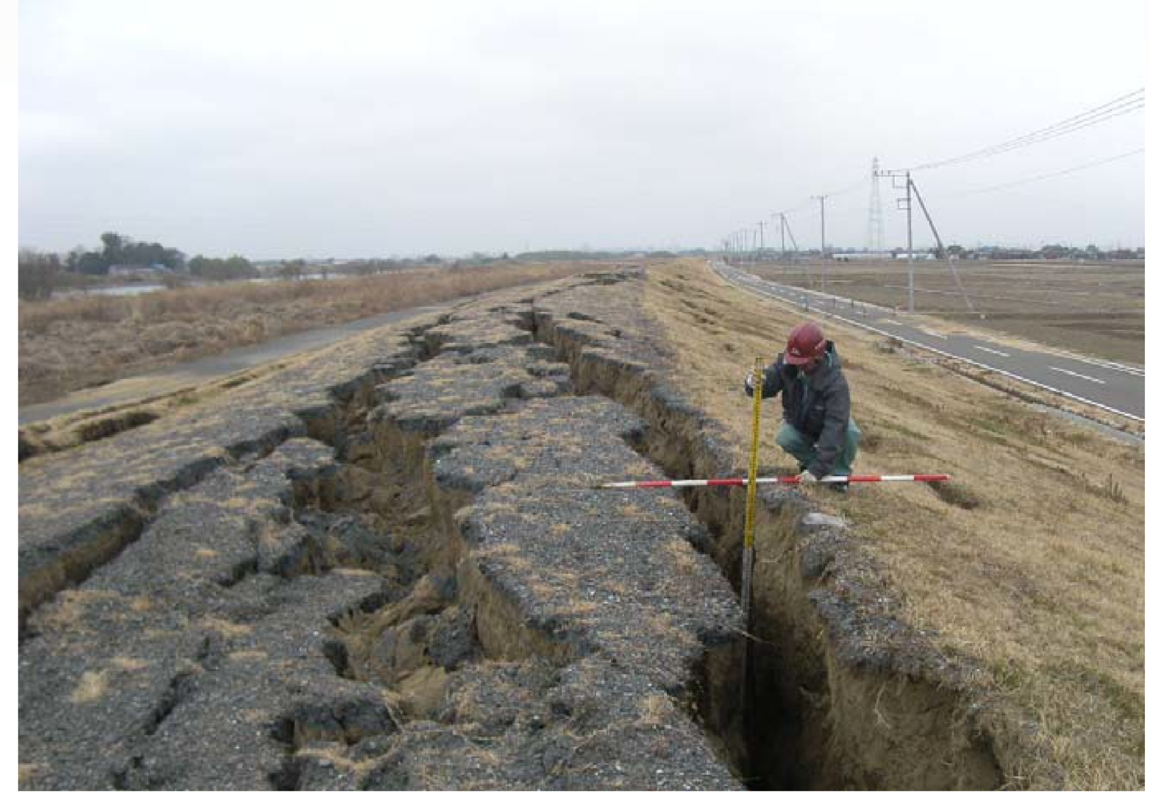
Earthquake Damage to Riverbank (Naka river, Ibaraki Pref.)